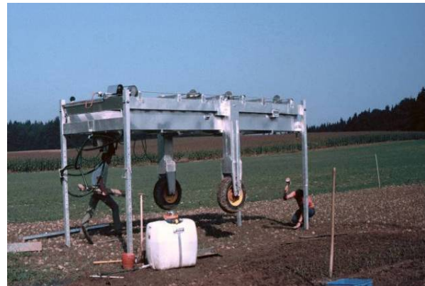
Figure 1: Top left: The ‘Swanson’ rainfall simulator was used in the WS data set. Top right: The ‘Kainz Regner’ was used in the FS and SY data sets. Bottom right: Gerlinger’s (1997) rainfall simulator from the WB data set which in a slightly different set-up was also used for the FB data set (Michael 2001).